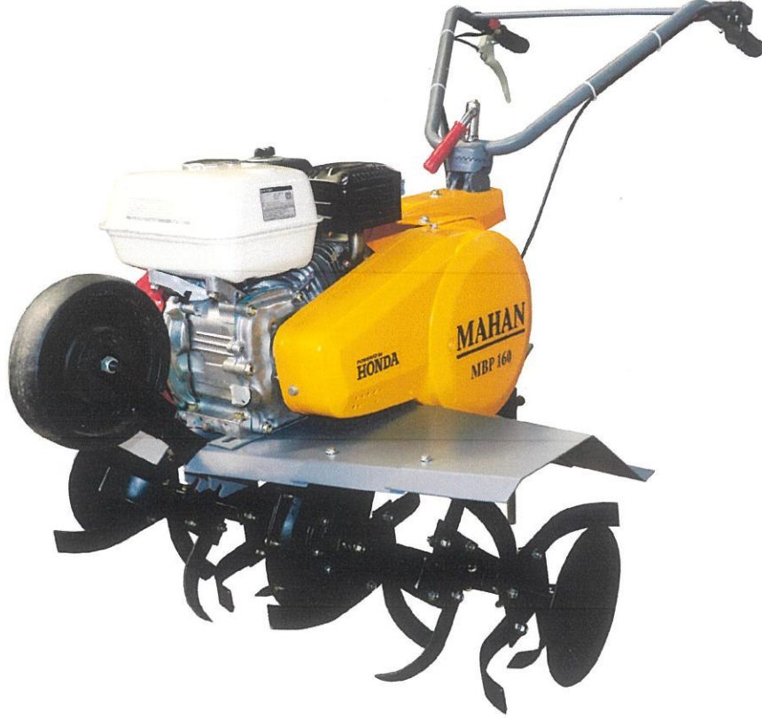
MAHAN, MBP-160, POWER WEEDER